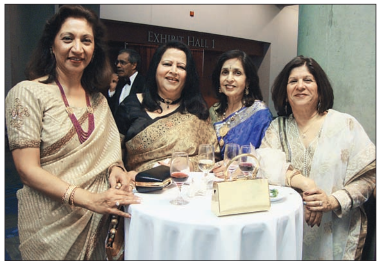
Ladies chilling out with wine at the "Scarlet Night" gala.